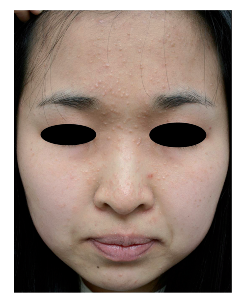
Fig. 1. Multiple rice grain-sized papules were present on the face.

According to the results of mRNA sequencing, the novel germline deletion mutation causes transcriptional skipping of exon 3. The novel germline mutation identified in this study is predicted to cause single amino acid substitution