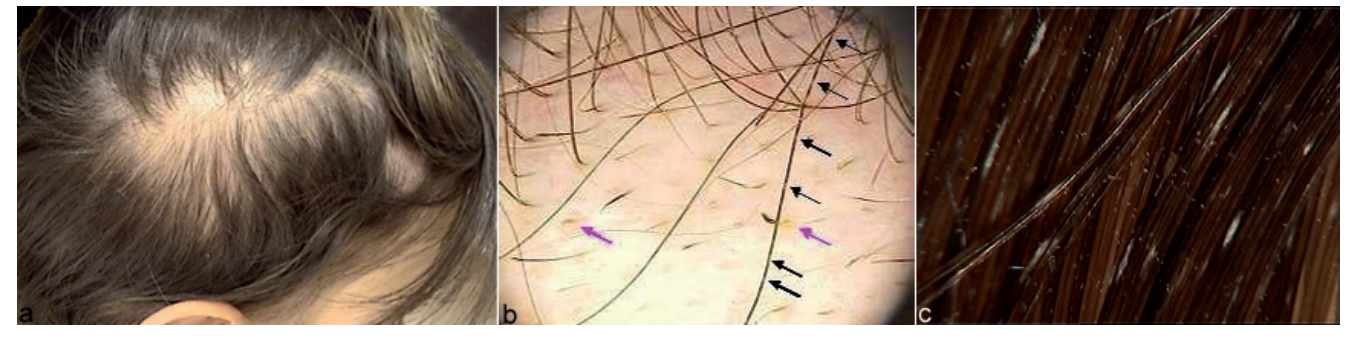
Fig. 2. Simultaneous manifestation of pili annulati (PA) and alopecia areata (AA) in a 38-year-old Caucasian female of Italian origin. (a) Patchy hair loss indicative of AA. (b) Dermoscopy at 20× magnification depicting PA ( black arrows ) as well as yellow dots and dystrophic hair ( pink arrows ) characteristic for AA. (c) PA at higher magnification (70×).

In all 7 patients, PA was exclusively restricted to the scalp. Five of these individuals had had more severe episodes of AA (alopecia totalis or universalis). The prevalence of AA was higher in patients with PA than in unaffected family members. Seven out of 76 individuals affected by PA also had AA, whereas none of the 86 unaffected family members showed PA (p=0.043).