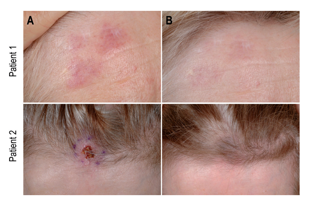
Fig. 1. Clinical appearance of skin lesions in two patients (A) prior to rituximab infusion and (B) after rituximab infusion.

Our study clearly demonstrates the effectiveness of intravenous rituximab in multifocal PCFCL, with 100% OR, including 64% CR. These results are in accordance with the three previous studies concerning intravenous rituximab in PCFCL (11–13). These 3 previous reports, concerning, respectively, 8 (11), 10 (12) and 11 patients (13) obtained 100% OR with, respectively, 75%, 80 % and 100% CR. However, in these 3 series, multifocal CFL represented only 12%, 80% and 63% of cases, which represents, respectively, 1, 8 and 7 patients. In the literature, five other isolated cases of multifocal PCFCL treated with rituximab have been reported (10, 15, 16); our study is thus, to date, the largest series of patients with multifocal PCFCL treated with intravenous rituximab. In our work, a local relapse was observed in 45% of patients after a median of 12 months following