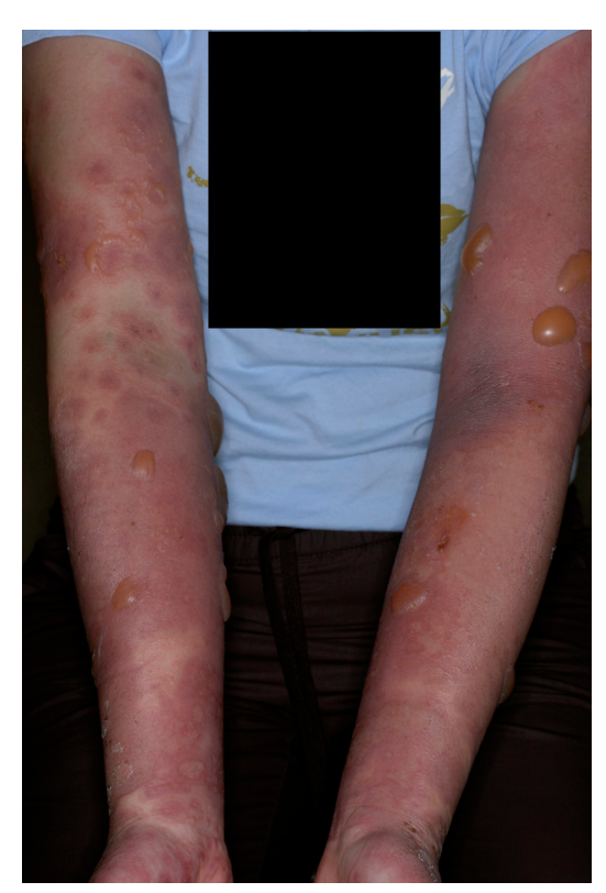
Fig. 1. Confluent erythema with bullae and satellite target lesions on the upper extremities.

A 33-year-old woman presented with severe diffuse erythema and blisters with a target-like aspect on her face, extremities and trunk. She had no history of drug intake, atopic dermatitis, herpes simplex or other infectious disease during the previous months. For the preceding 16 days she had worked in the printing industry. Although she had worn goggles, gloves, and protective clothing, her face and arms had come into contact with UV-cured inks, and her clothing had become soaked in the inks. After one week of work, she had developed erythema with itching on her arms and face. She was treated with topical glucocorticoid ointment by a dermatologist, but the erythematous papulo-vesicles worsened over the area contacted by the inks. Subsequently, she developed multiple dull-red macules with