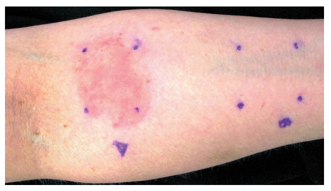
Fig. 1. A positive reaction to the repeated open application test of sample B (treated oak moss absolute) at 0.10% (w/v) in subject 12 on day 14.

The oak moss-allergic subjects applied a mean of 140 mg/day (range 88–230) of the ROAT solutions to each test site and the controls applied a mean of 130 mg/day (range 86–230).