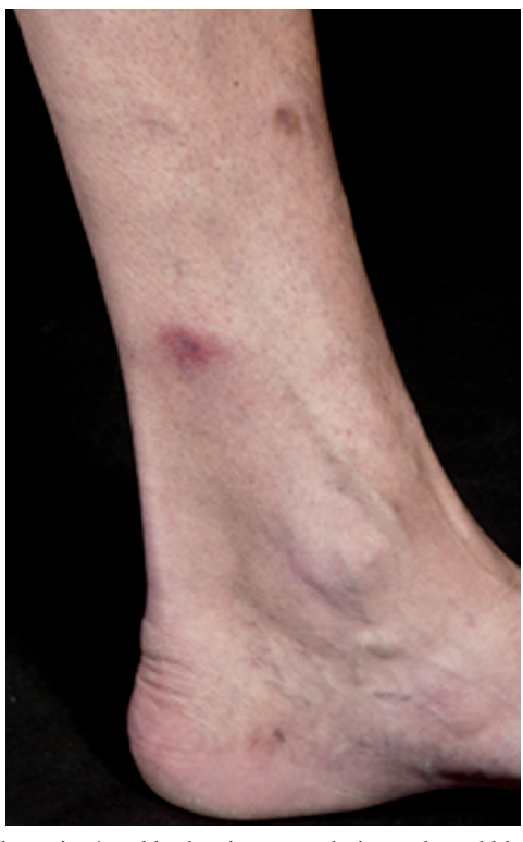
Fig. 1. The patient's ankle showing a new lesion and an old lesion with hyperpigmentation.

The first biopsy taken by the private dermatologist revealed a markedly epidermotropic infiltrate, and superficial dermal band-like and deep perivascular infiltrates of small slightly atypical lymphocytes (Fig. 2). The lymphocytes showed a cytotoxic CD3<sup>+</sup>, CD8<sup>+</sup>, Tia-1<sup>+</sup>, Perforin<sup>+</sup>, CD56<sup>+</sup> immunophenotype and also expressed the pan-T-cell markers CD2 and CD5, but partly lacked CD4 and CD7 (Fig. 3). Molecular genetic analysis showed clonal rearrangements of T-cell receptor genes. The histopathologic conclusion was a cutaneous CD8<sup>+</sup> epidermotropic cytotoxic clonal T-cell infiltrate suspicious of an aggressive epidermotropic CD8<sup>+</sup> cytotoxic T-cell lymphoma.