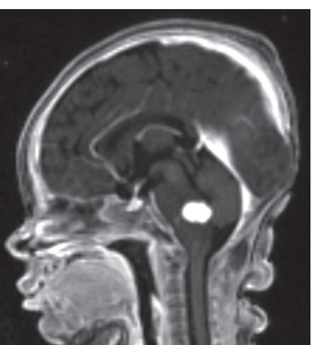
Fig. 2. Brain MRI showing a highly vascularised brain stem tumour (white spot) first suspected for glioma.

Pyogenic granuloma, also known as botryomycoma or lobular capillary haemangioma, is a very common solitary benign vascular tumour, which usually develops on normal skin at the site of minimal skin trauma. At times it occurs spontaneously, particularly in children and