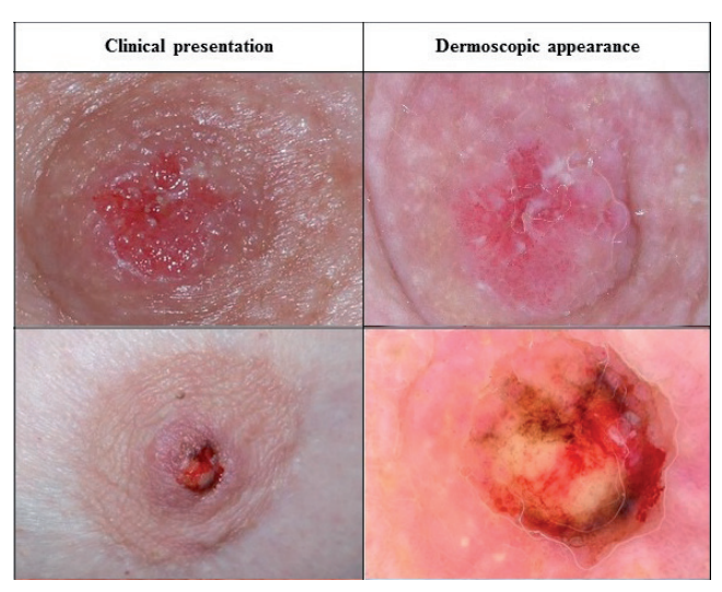
Fig. 1. Clinical and dermoscopic appearance in mammary Paget's disease. Patient 1 (top) shows a typical appearance; patient 5 (bottom) an uncommon pigmented form. Photographs for all 5 patients are shown in Fig. S1<sup>1</sup>.

Examples of clinical and dermoscopic images are shown in Fig. 1. Typical clinical presentation of MPD was seen in all but one case (patient 5): well-demarcated eczema-like plaques involving the nipple/areola complex; erosive, oozing or fissured surface; and brown-to-yellow crusts or scales. Patient 5, a 58-year-old woman, presented with a 2-month history of a fast-growing, partially pigmented nodule on the left nipple, mimicking melanoma under clinical inspection. Histopathological examination revealed in all cases a proliferation of large PCs with hyperchromatic nuclei and abundant clear cytoplasm. These cells stained positively for cytokeratin 7 (CK7) in all cases, supporting the diagnosis of MPD. As clinicopathological correlation could not rule