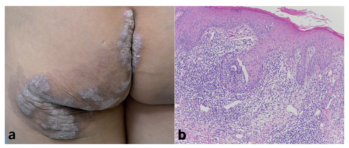
Fig. 1. (a) Hyperkeratotic erythematous plaques and peripherally hyperpigmented patches on the left buttock and intergluteal cleft.(b) Irregular acanthosis and dense lymphohisticcytic infiltration with granulomatous inflammation (hematoxylin and eosin (H&E) staining, original magnification × 100).

What is your diagnosis? See next page for answer.