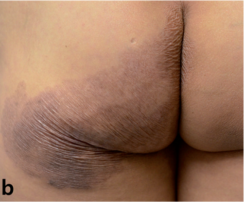
Fig. 2. (a) Granulomatous infiltration throughout the dermis with giant cells in the mid dermis (H&E staining, original magnification \times 200). (b) Completely resolved hyperkeratotic plaques after 5 months of treatment.