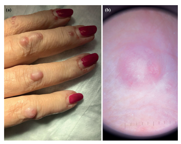
Fig. 1. (a) Multiple reddish-brown, firm, non-scaly, non-tender papules and nodules on the right hand of a 65-year-old Caucasian woman. The lesions have a "coral bead" appearance around the proximal nail-folds. (b) Dermoscopy revealed an orange-reddish background colouration with central paler yellow deposits.

A 65-year-old Caucasian woman presented with nodular erythematous lesions on her hands. The lesions had appeared approximately 10 months previously. She reported itch and intermittent pain and swelling of the finger joints (Fig. 1). Proximal interphalangeal, metacarpophalangeal, wrist, elbow and knee arthralgias, together with magnetic resonance imaging (MRI) showing an erosive arthropathy, and a negative test for rheumatoid factor and anti-cyclic ci-