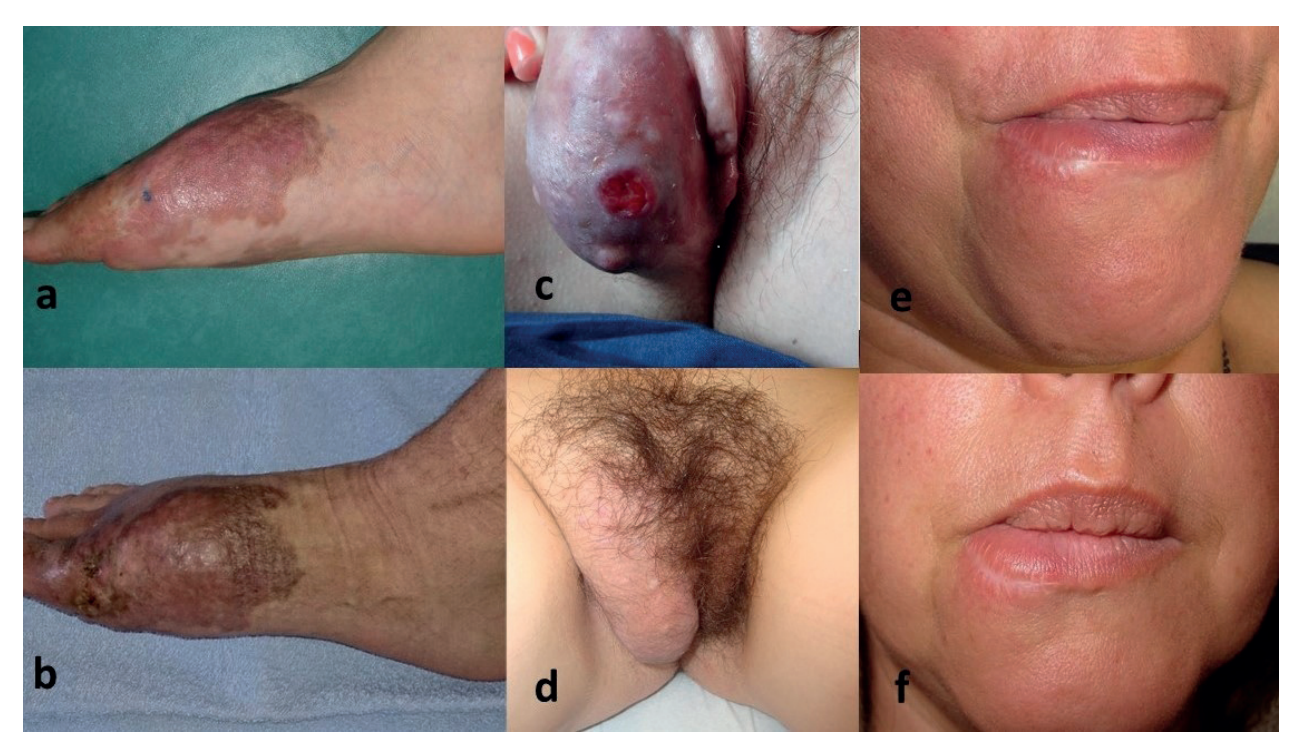
Fig. 1. Arteriovenous malformations (AVM): clinical features in patients 2 (a, b), patient 4 (c, d) and patient 10 (e, f). a (M2) and b (M10): AVM of the right foot that first showed partial response to sirolimus, then a worsening (increase in volume and necrosis after 9 months' treatment). c (month [M] 0) and d (M2): AVM of the vulva that showed major improvement after sirolimus (decrease in volume and healing of necrosis). e (M0) and f (M5): AVM of the lower lip that showed minor improvement after sirolimus (slight decrease in volume).

relapse after 9 and 24 months, respectively, characterized by an increase in volume of the AVM and skin necrosis; 1 patient reported major improvement of the AVM on the 5-point Likert scale and 4 minor improvement (Fig. 2). Among the 5 non-responders, AVMs were first stabilized in 3 cases, then showed progressive worsening, and for 2, AVMs immediately became worse.