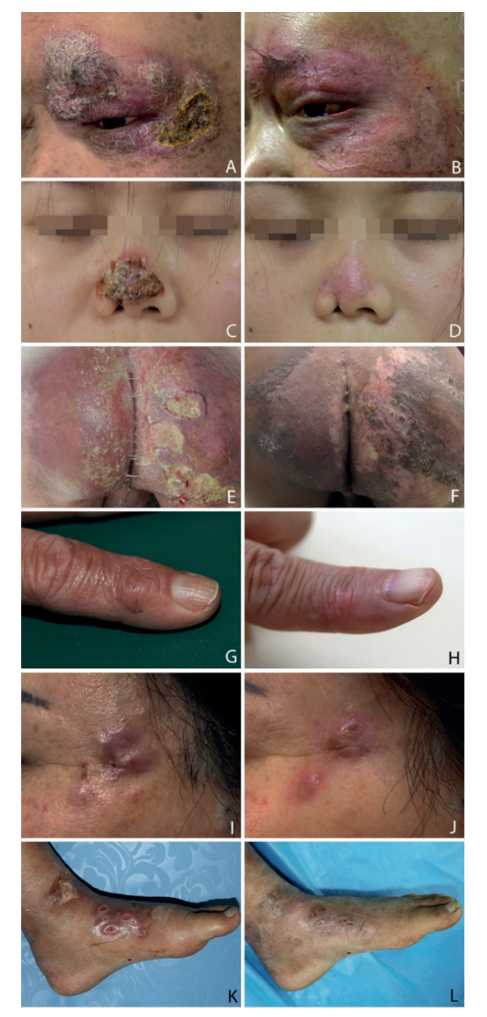
Fig. 2. Cutaneous tuberculosis (TB)/nontuberculous mycobacteria (NTM) infection after antibiotic treatment. (A, B) Tuberculosis verrucosa cutis for 4 months and after 9 months of standard antituberculosis treatment. (C, D) Lupus vulgaris for 5 months and after 3 months of standard antituberculosis treatment. (E, F) Tuberculosis cutis orificialis for 20 years and after 3 months of antituberculosis treatment. (G, H) Mycobacterium marinum infection treated with clarithromycin and moxifloxacin for 6 months. (I, J) Mycobacterium abscessus infection treated with clarithromycin and moxifloxacin for 1 month. (K, L) Mycobacterium chelonae infection treated with clarithromycin 2 months.

Cutaneous tuberculosis and nontuberculous mycobacterial infections 1001