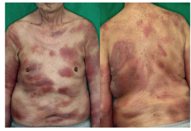
Fig. 1. Clinical photographs at initial visit. Indurated plaques, erythema and tumours on the trunk.

leukocytosis with no peripheral atypical cells. Anti-human T-cell leukaemia virus type-1 antibody was negative.