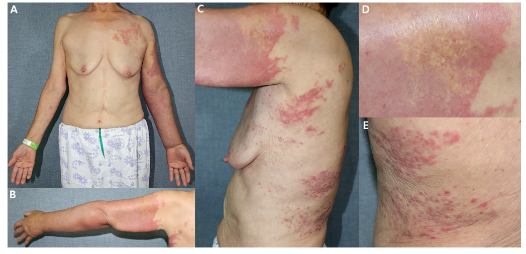
Fig. 1. Clinical features. (A, B) Diffuse tender erythematous and yellow cellulitis-like patches on the left arm. Marked oedema on the left arm is contrasted with the right arm. (C) Yellowish atrophic scars and erythematous active lesions were interspersed with numerous telangiectasia on the proximal area of the left arm. Multiple erythematous papules on the trunk were seen. (D, E) Close-up view of the yellowish atrophic scars and erythematous papules, respectively.

To diagnose her unusual lesion, skin biopsy was performed. Histopathological findings showed epithelioid granuloma with caseous necrosis in the upper dermis, and mixed cell infiltration with vascular proliferation in the deep dermis (Fig. 2A). Under higher magnification, caseous necrosis, palisading epithelioid histiocytes, multinucleated giant cells, perivascular lymphocytic infiltration, and dermal fibrosis were observed (Fig. 2B, C). Periodic acid-Schiff (PAS) staining was negative, and Ziehl-Neelsen staining revealed a few acid-fast bacilli on both specimens from the arm and trunk lesions. Based on the histopathology, cultures and the real-time polymerase chain reaction (PCR) test for mycobacteria were carried out. No bacterial growth was seen at 37°C. After 2 weeks of incubation at 30°C, 3% Ogawa media presented whitish colonies that turned vellow under direct exposure to light. In the PCR sequencing, genomes matched with