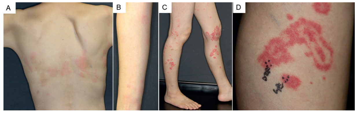
Fig. 1. (A) Erythema on the back. (B, C) Erythema gyratum repens-like eruptions on the lower limbs. (D) Erythema on the upper limb.

What is your diagnosis? See the next page for the answer.