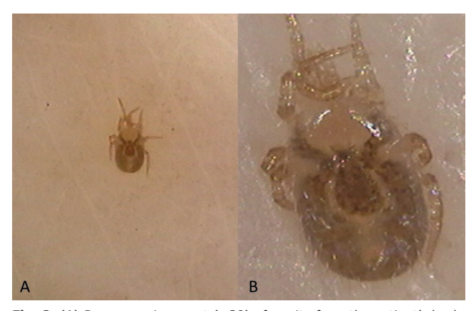
Fig. 2. (A) Dermoscopic aspect (×30) of a mite from the patient's back. (B) At high magnification (×150) the mite appears red-brown in colour with 4 pairs of limbs, and an ovoidal body engorged with blood.

What is your diagnosis? See next page for answer.