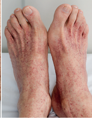
Fig. 1. Petechial purpura on the lower legs in a 56-year-old man. The patient has given written informed consent to publication of the case details.