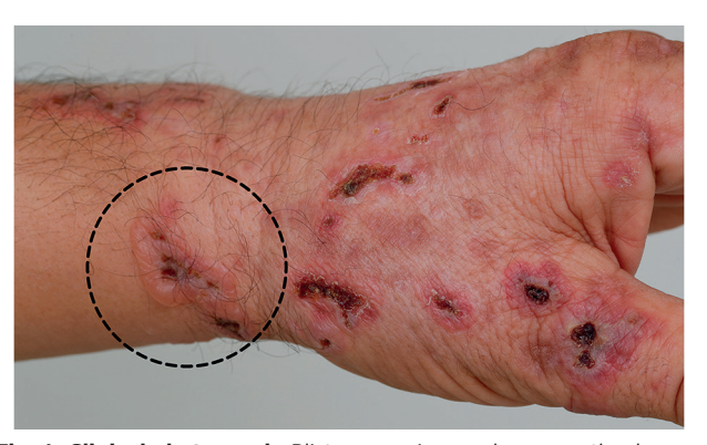
\textbf{Fig. 1. Clinical photograph.} \ \ \textbf{Blisters, erosions and scars on the dorsum of the hands and forearms. Circled: bulging blister.}

Histology revealed superficial, perivascular, eosinophil and neutrophil dermatitis with subepidermal blistering. Perilesional direct immunofluorescence staining showed deposition of C3c (Fig. 2) and IgG at the dermo–epidermal