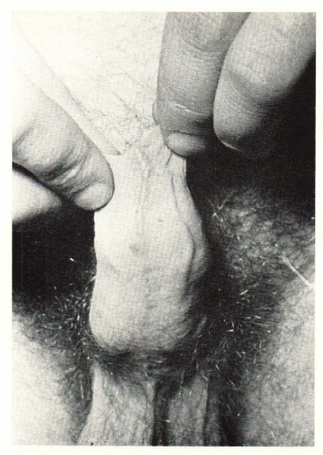
Fig. 1. Longitudinal swelling in the rappe penis of a 24-year-old patient.

the presence of the duct might lead to further infections—as known from the literature. Under local anesthesia the entire duct was excised into the healthy tissue. Z-suture of the skin edges followed. After the opening of the duct no communication was found with the urethra by means of a probe. The duct ended blindly in the skin near the penoscrotal sulcus. The wound healed without complications. A smooth hardly perceptible scar has remained in the penile raphe.