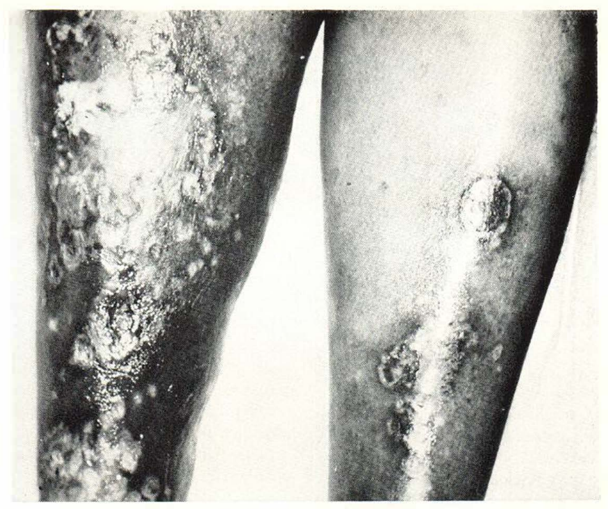
Fig. 1. Pretibial areas of Case I showing extensive leg ulcers. The borders are distinctly papular.