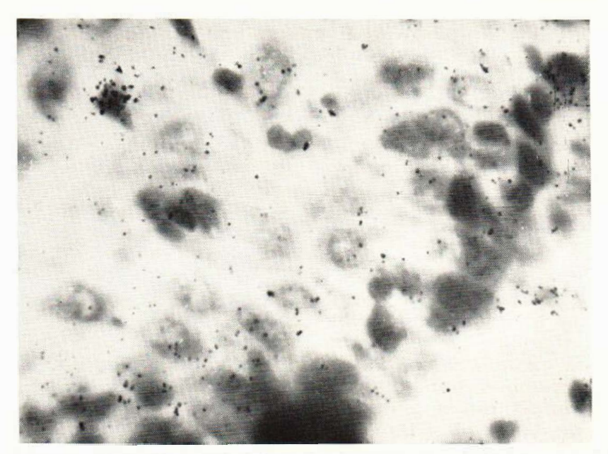
Fig. 3. Mucinosis follicularis—idiopathic form. Slight incorporation of <sup>35</sup>S into a hair follicle undergoing considerable mucinous degeneration.