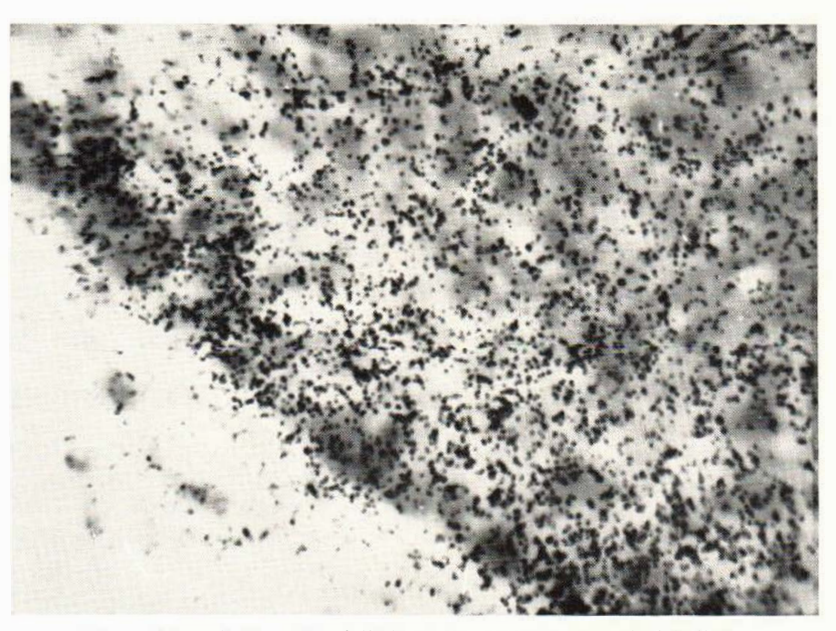
Fig. 4. Normal skin. Hair follicle during anagen, strongly labelled.

respective of that whether it is chondroitin sulphate or hyaluronosulphate which is digested by hyaluronidase, or both) account only for a part of mucin, their increased synthesis should be demonstrable in our experiments. In m.f. there is no 6 - 337-1088. Acta Derm. 49: 1