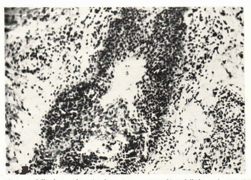
Fig. 2. Mucinosis follicularis-idiopathic form. Degeneration of hair follicles with cystic changes.

Fig. 1. Mucinosis follicularis-idiopathic form. Aggregated perifollicular papules on the chest.