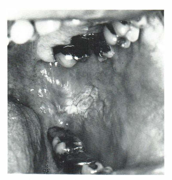
Fig. 1. Leukoplakia of left buccal mucosa in a 60-year-old man smoking 75 g of pipe tobacco per week.

laboration Centre for Oral Precancerous Lesions (11). The criteria for inclusion in the study of oral leukoplakias and the details of registration have been reported earlier, (6, 8).