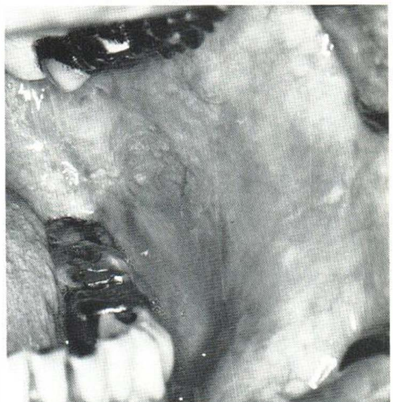
Fig. 2. After reduction to one-third the daily amount of tobacco there is regression but persistence of the leukoplakia at the 3-month control.

Table 1 shows the distribution and the degree of compliance of the patients in giving up smoking. Among males 30.7% came in the low-compliance group of 3 months' reduction, against 14.3% of the females. In the intermediate group of 3 months' abstinence there was the same proportion. 50%, for both females and males. Among females as many as 34.9% gave up smoking permanently as compared