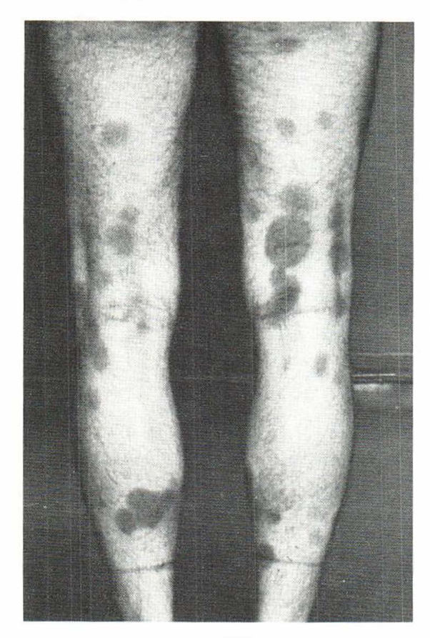
Fig. 1. The patient after sun exposure.

F 20 WIPUVA tubes which gives a clean UV-A spectrum with maximum at 365 nm was used.