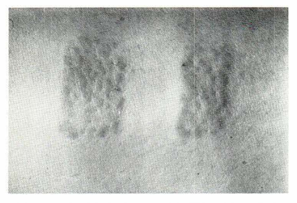
Fig. 2. Polymorphos light eruption provoked by the test in a woman who can tolerate Swedish summer sun well.

Most of the subjects with an increased sensitivity to UVA-light after drug intake noticed a burning and stinging sensation shortly after exposure. The erythematous reaction had not disappeared at 72 hours in any of the cases.