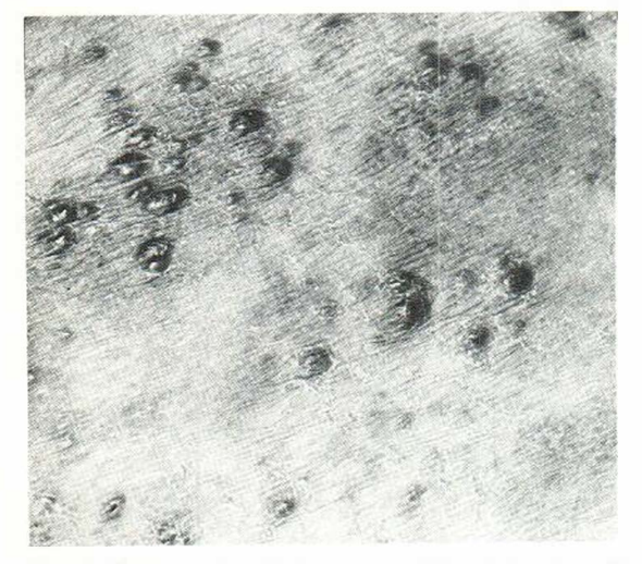
Fig. 1. Close-up of multiple papulonodules at the start of the eruption.

pronounced. Some of the cells were pyknotic. Frequent mitoses could still be seen.