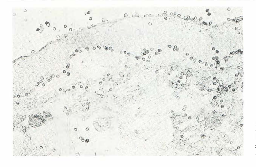
Fig. 1. Leukocytes were attached specifically to the BMZ and horny layer mediated by complement-fixing antibodies.