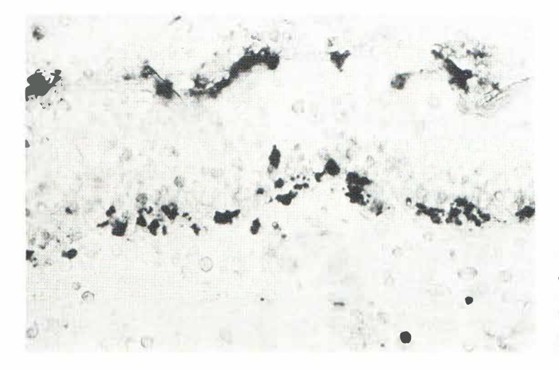
Fig. 4. Leukocytes bound to the BMZ and horny layer incorporated NBT dye complexes into their cytoplasms and formed blackish-blue crystals of formazan. Note the other leukocytes non-specifically adherent to the slide glass and tissue specimens, showing little incorporation of NBT dye complexes.

The proportions of eosinophils attracted to the BMZ mediated by complement-fixing anti-BMZ antibodies were determined by counting the number of eosinophils among 200 to 400 adherent cells at the BMZ of 6 to 8 tissue specimens, and compared with those in cell suspensions. The results showed that the proportion of eosinophils attached to the BMZ