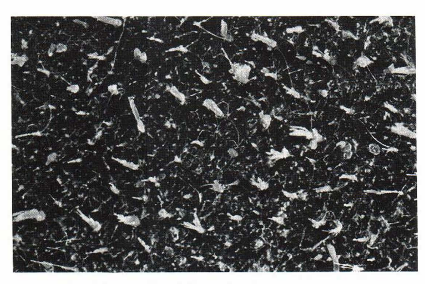
Fig. 2. Density of microcomedones before treatment.

These were young male and female college students with moderately severe inflammatory acne vulgaris. We ac-