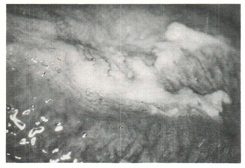
Fig. 1. White, irregular plaque on the right side of the tongue, before treatment with penicillin.