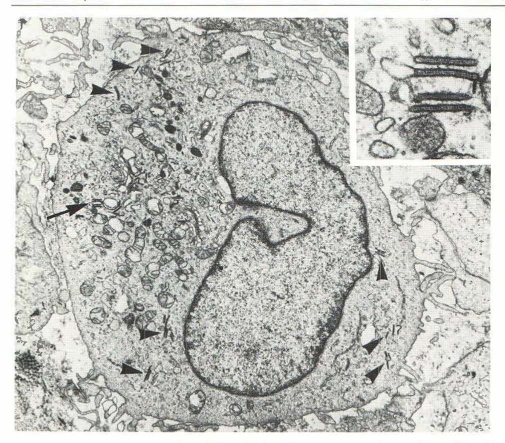
Fig. 2. Electron microscopy showing a histiocytic (Langerhans) cell from the same biopsy (Fig. 1). Many rodshaped granules are present in the cytoplasm (arrowheads). ( \times 6200 .) A large magnification ( \times 2000 ) of granules at arrow is shown as inset. The typical structure of Birbeck granules with parallel membranes and a central electron dense line with the characteristic periodicity is demonstrated.

We have previously described a 16q22 chromosomal defect in a boy with an atypical Epstein-Barr virus infection leading to death from a Burkitt-like lymphoma (4). The 16q22 defect was also found in several of the boy's family members (5).