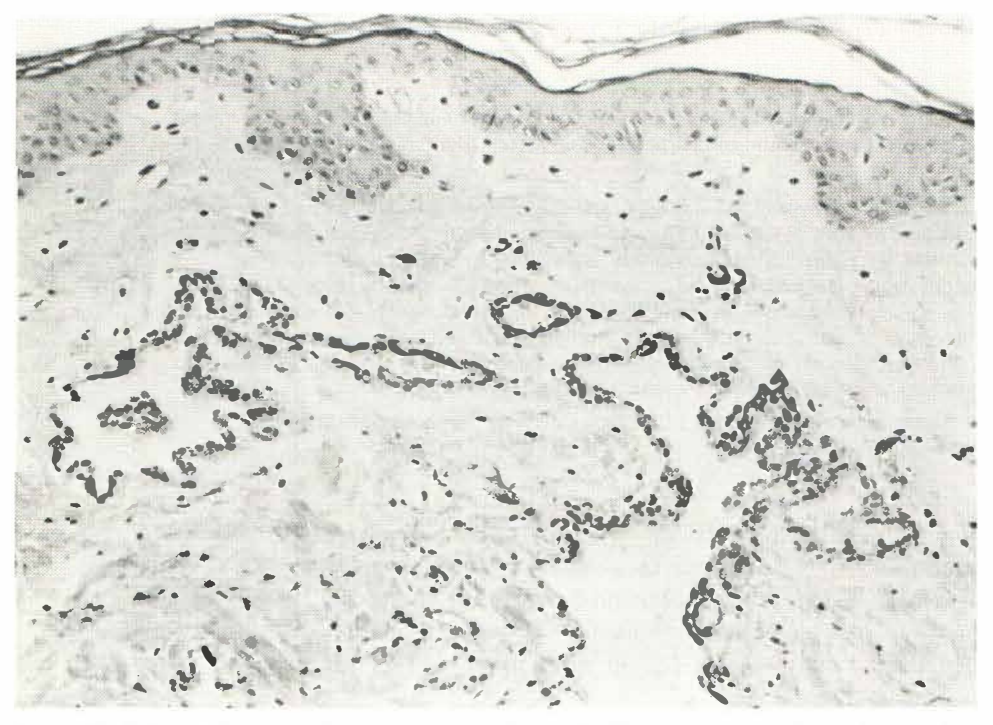
Fig. 2. Dilated vascular spaces in the upper and mid dermis. The vascular walls showed one to three layers of round glomus cells outside the flattened endothelial cells (Hematoxylin-Eosin).