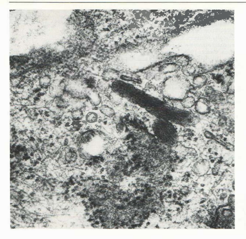
Fig. 3. Weibel-Pelade body within cytoplasm of an angiosarcoma cell (Transmission electron micrograph ×87 500).

Immunological and ultrastructural findings related to angiosarcoma of the face and scalp and postmastectomy angiosarcoma have been variable but Weibel-Pelade bodies are not generally seen and it is possible they may be derived from lymphatic vessels (5). However, Weibel-Pelad bodies have been identified in angiosarcoma of the superior vena cava (6) and central nervous system (7) and in the latter case positive staining was seen for factor VIII related antigen, lectin and laminin. In our case, the presence of occasional intracytoplasmic Weibel-Pelade bodies in the tumor cells and the weak positivity for factor VIII related antigen, Ulex lectin and laminin, supports a blood vessel rather than lymphatic origin. The occurrence of angiosarcoma on the leg is extremely uncommon but has been previously described. A common factor in all published acral cases has been the presence of severe persistent pedal oedema (3, 8) and in one case varicose veins were also present (8).