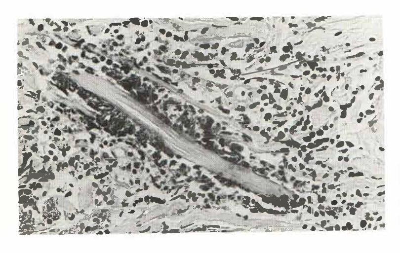
Fig. 4. Case 1. One incompletely developed flame figure. Rather loose aggregates of eosinophilic granules are surrounding a collagen bundle. There is no ring of fibroblasts or histiocytes.