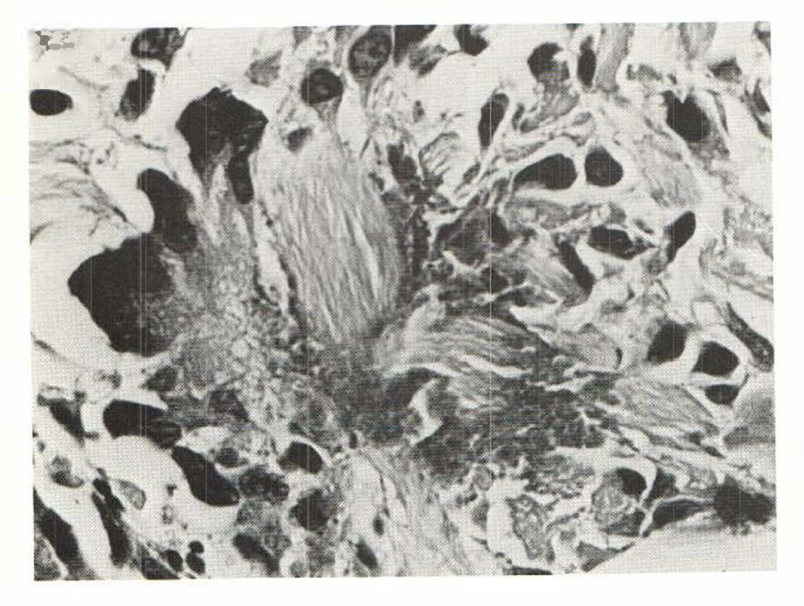
Fig. 3. Case 2. A fully developed flame figure with connective tissue in the center. At higher magnification the eosinophilic granules are easily visible. To the left, giant cells.