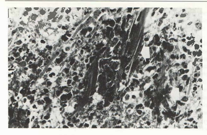
Fig. 5. Case 1. A focus with large numbers of eosinophils, nuclear fragments and expelled eosinophilic granules. The arrows indicate incompletely developed flame figures.