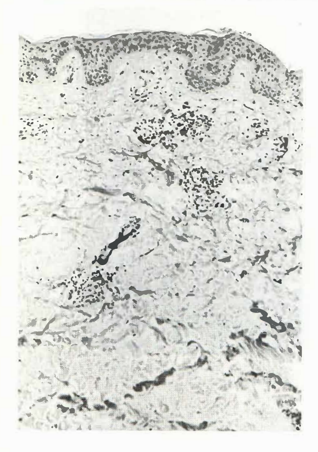
Fig. 2. Micrograph of a section of biopsied skin showing perivascular round cell infiltrates in the dermis. The latter has an edematous appearance due to the mucinosis. Haematoxylin and eosin, ×65.