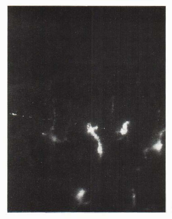
Fig. 4. HLA-DR-positive dendritic cells in lesional epidermis (magnification \times 175 ).

therapy. Nerve fibrils were not seen in the epidermis, nor was there any notable structural difference between lesional and control stratum corneum.