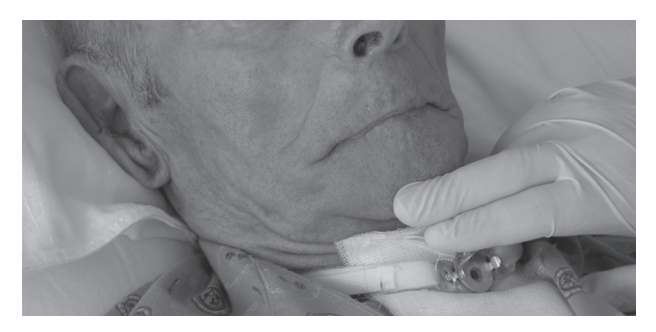
Fig. 2. Ulcer healing after 2 botulinum toxin type A(Dysport®) infiltrations of 320 units per single session.

was graded as stage II–III according to the European Pressure Ulcer Advisory Panel wound classification system (6). Because of this dyskinetic movement disorder, all efforts at healing the ulcer by topical medication had failed. Treatment of the oro-mandibular dyskinesia was attempted in order to reduce the strength of mouth closure and to weaken the inflexion and sucking of the lower lip to allow for medication of the ulcer.