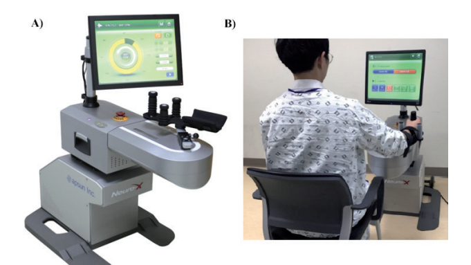
Fig. 1. (A) The newly developed upper extremity training system (Neuro-X®; Apsun Inc., Seoul, Korea) consists of a game monitor and an upper limb exercise plate. (B) Subjects were seated comfortably in a chair in front of the robot. The hemiplegic upper extremity was attached to the arm support located at the end of the device.

During the robot-assisted upper extremity rehabilitation treatment with the newly developed robot-aided upper extremity training system (Neuro-X<sup>®</sup>) (Fig. 1A), subjects were seated