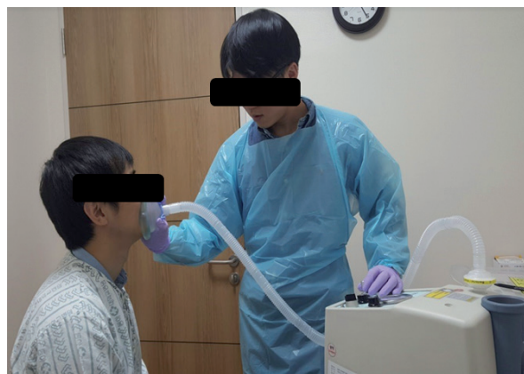
Fig. 2. Study group received mechanical inspiration and expiration exercise using mechanical cough assist machine.

Conventional dysphagia rehabilitation consisted of oral motor and sensory stimulation, neuromuscular electrical stimulation of the suprahyoid muscle, and oral and lingual exercises to