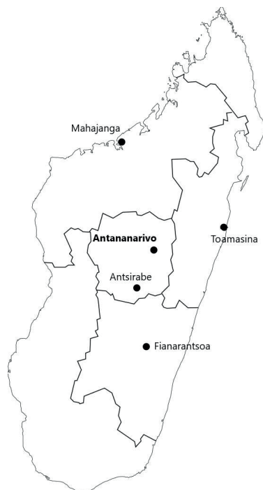
Fig. 2. Location of rehabilitation centres in Madagascar included in the evaluation (17).

Sixty semi-structured interviews were carried out (Table III) in Madagascar. Eight focus groups were also conducted; the 50 participants included rehabilitation doctors, physiotherapists and prosthetic/orthotic technicians from 6 rehabilitation centres (Fig. 2).