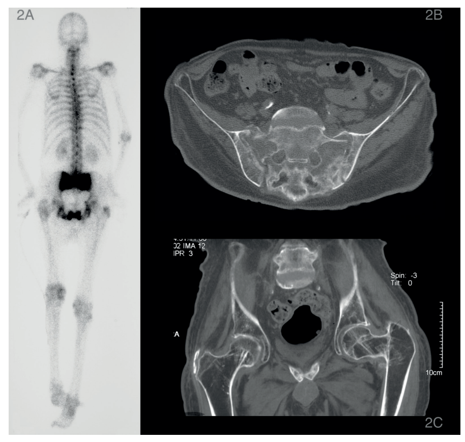
Fig. 2. Case 2: A) Bone scintigraphy showing classic "H" sign confirming increasing uptake bilateral sacral ala and pubic rami. B) CT scan showing bilateral sacral fractures extending into zone2 and 3of sacrum (as per Denis classfication). C) CT scan of the same patient showing bilateral old healed pubic rami fractures with old per trochanteric fracture of left hip.

tion therapy, hyperparathyroidism, osteomalacia, renal osteodystrophy, rheumatoid arthritis, anticonvulsant therapy, Cushing's syndrome, primary biliary cirrhosis, and myelomatous disorders, which can lead to secondary osteoporosis, may all contribute indirectly to SIFs (2). Patients with SCI respond to noxious stimuli differently from able-bodied individuals, as a result of diminished or absent sensation below the level of spinal injury. These patients manifest their symptoms as secondary complications of SCI, namely increased spasms, exaggerated neuropathic pain, chronic constipation and/or frequent episodes of autonomic dysreflexia (4, 5).