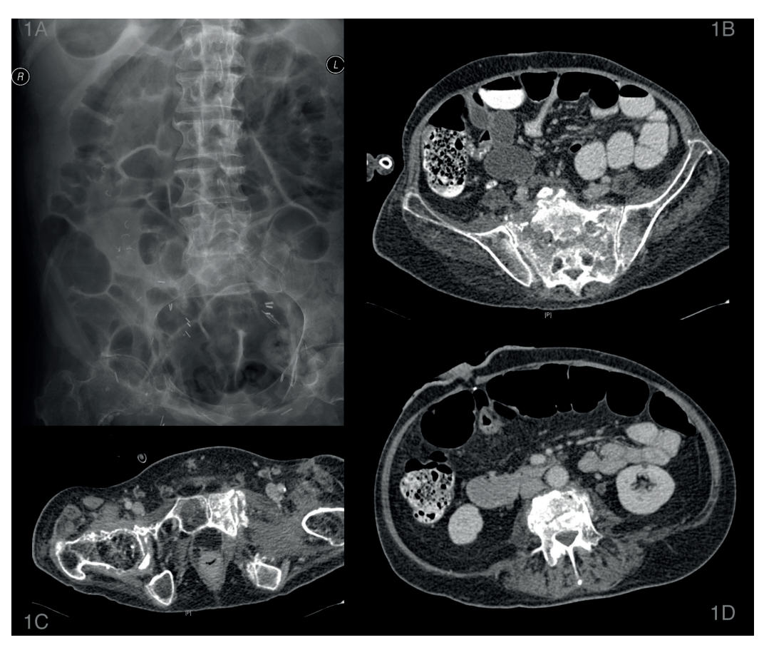
Fig. 1. Case 1: A) Plain abdominal x-ray showing the prominent loops of bowel usually masking detection of sacral fracture. B) Computed tomography(CT) showing sacral insufficiency fracture extending into the sacral canal, Denis type 2 fractures bilaterally. C) CT scan of the same patient showing incidental old healed pubic symphysis pubic rami fracture, D) CT scan of the same patient showing old healed incidental L4 lumbar spine fracture.

SIFs occur most commonly in women aged > 55 years whose bone strength is inadequate to withstand normal repetitive stress (2, 3). Several conditions can predispose to SIFs: postmenopausal osteoporosis being one of the main causes. Also, the long-term use of steroids, radia-