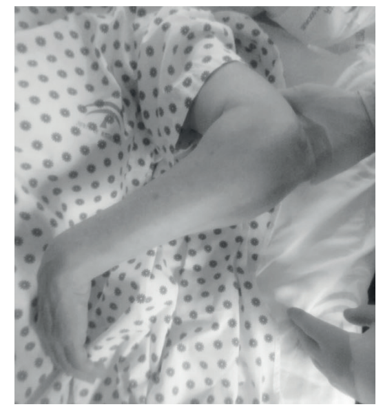
Fig. 2. Elbow and wrist flexors in paretic left upper limb in patient before being treated with incobotulinumtoxinA.

Subsequent monitoring was carried out between the rehabilitation, neurology and internal medicine departments. Despite clinical improvement during hospitalization, the patient developed early post-stroke spasticity ( Fig. 2 ). Modified Ashworth Scale (MAS) was grade II in her left elbow and wrist flexors, and in the left gastrocnemius. The patient experienced pain on passive mobilization, scoring 8 points in the visual analogue scale (VAS) and 0.72 points in the European Quality of Life-5 Dimensions (EQ-5D)-5L questionnaire.