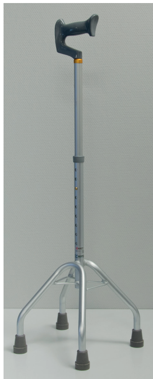
Fig. 2 Quadripod cane

All of the participants benefited from a short (few minutes) training session performed by the physical therapist involved in the study to familiarize themselves with the rolling cane. The rolling cane Wheeléo® is a new device. It weighs 2.7 kg and the height can be adapted from 74 to 98 cm. Before starting the experiment, the global neurological impairments were assessed using the Stroke Impairment Assessment Set (SIAS) (9). The resting heart rate (RHR), in beats per min (bpm), and the presence of beta-blocker medication were also monitored. During each session (with the quadripod cane (Fig. 2) or rolling cane (Fig. 3)),