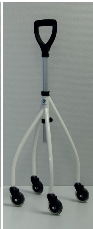
Fig. 3 Rolling cane