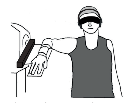
Fig. 2. Patient's position for assessment of joint position sense and kinesthetic sense.

A continuous passive motion (CPM) apparatus was used to evaluate shoulder proprioception for both joint position sense (JPS) and kinesthetic sense (Fig. 2). The shoulder was initially positioned at 90° of abduction, and the elbow was positioned at 90° of flexion. The reference angle in the JPS test was set as 50% of the maximum ROM. Before the JPS test, the participants were given 3 exercises to reproduce the reference angle and become familiar with the testing procedure. Then, the CPM rotated the shoulder at a rate of 1°/s into the internal rotation position from the start position to the joint position previously experienced. When the patient perceived that his/her shoulder had reached the reference position, the actual angle was measured. The error between the reference angle and the actual angle was calculated. The test procedure was repeated 3 times. The kinesthetic sense was detected by measuring the threshold to detection of passive motion (TTDPM). The CPM rotated