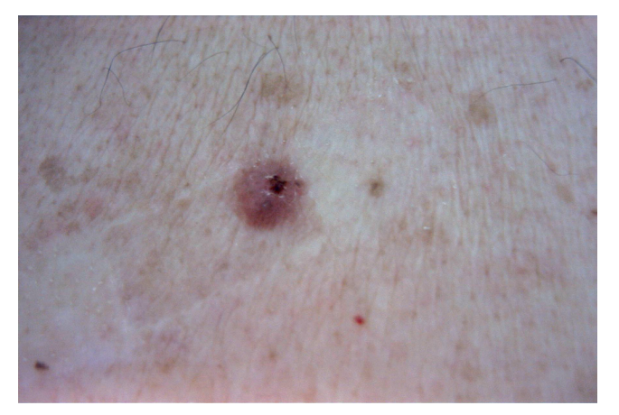
Fig. 1. Clinical aspect of the 0.8 cm lesion on the right shoulder.

Immunohistochemically, the neoplasm expressed diffuse positivity for pancytokeratin (CK) and CK 19