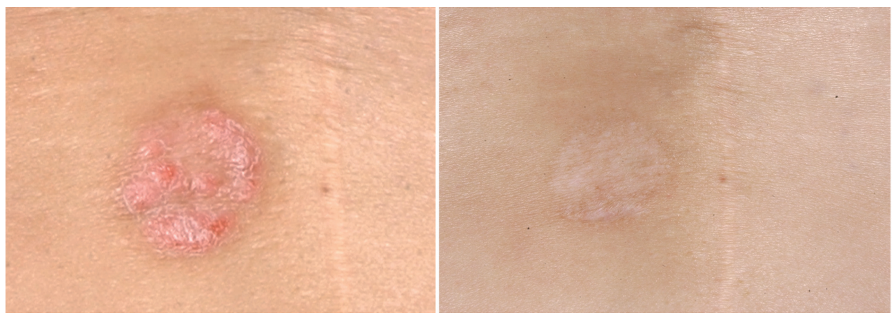
Fig. 1. Close-up of a mycosis fungoides lesion responding to bexarotene therapy. In this patient, 25–32% of the cell nuclei showed tetrasomic chromosome 12 and NAV3 copy numbers in samples obtained during treatment.

We observed two types of chromosomal copy number alterations in the target skin lesions of these patients.