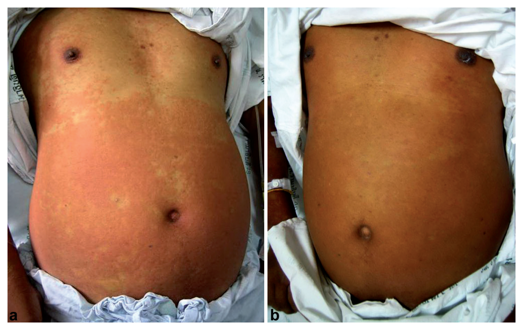
Fig. 2. (a) Generalized erythematous maculopapular rash in a patient with drug reaction with eosinophilia and systemic symptoms (DRESS). (b) Ten days after discontinuation of culprit drug, and administration of systemic corticosteroids.

Hepatic involvement was seen in 96.3% of patients; this is the most common systemic involvement. Among those with hepatic involvement, the mean serum alanine aminotransferase and aspartate aminotransferase are 188 IU/l (range 132–1708 IU/l) and 132 IU/l (range 89–857 IU/l), respectively. Hyperbilirubinaemia was found in 9 patients (33.3%) with a mean serum total bilirubin of 32.7 \mu mol/l (range 18.9–244.2 \mu mol/l).