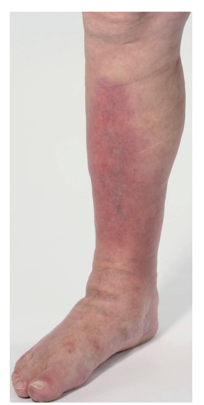
Fig. 1. Skin condition before treatment.

A 67-year-old man presented with recurrent erythema, accompanied by local warmth, oedema and tenderness on his right leg (Fig. 1). The patient reported generally being unwell and chills. An increase in body temperature was not observed. He had been treated for erysipelas with i.v. penicillin and clindamycin 3 times in the past 6 months. The last i.v. antibiotic treatment with clindamycin (600 mg tid, for 12 days) had finished 13 days prior to presentation. The portal of entry for the recurrent erysipelas was assumed to be mycologically-proven tinea pedis,