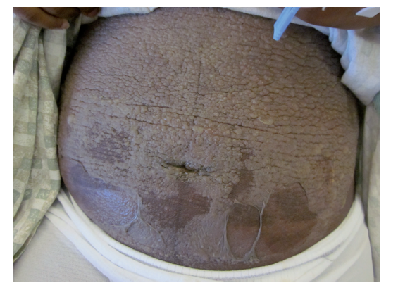
Fig. 1. Confluent, vesiculopustular lesions on the abdomen, associated with extensive erosions and pseudoverrucous features.

Whether hypocalcemia is a primary or secondary phenomenon in IH has not been adequately addressed (9). Our patient had a history of third trimester IH in her first pregnancy, an uneventful second pregnancy, and experienced postpartum IH following her third pregnancy. She had hypoalbuminemia (2.8 g/dl) and low-normal calcium 8.9 mg/dl during the third trimester of her first pregnancy. All pregnancies were reportedly with the same partner. Her first pregnancy produced a full-term male baby, while her second and third pregnancies produced full-term female babies. She denied a personal or family history of psoriasis. The disease in her first and third pregnancies may have been triggered by low or low-normal calcium, which can develop in pregnancy secondary to hypoalbuminemia, as seen in our case. The corrected serum calcium (9.4 mg/dl) and phosphorus were normal in our patient, which rules out hypoparathyroidism and vitamin D deficiency. Furthermore, hypoparathyroidism has been typically reported after surgical procedures, such as parathyroidectomy or thyroidectomy, and there is no history of such in our patient.