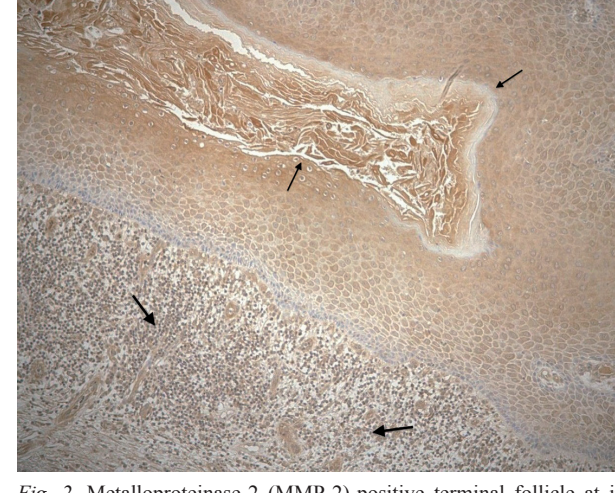
Fig. 2. Metalloproteinase-2 (MMP-2)-positive terminal follicle at infrainfundibular region and surrounding large plasma cells-dominating inflammatory infiltrate. Numerous epitheliocytes, macrophages and fibroblasts expressing matrix metalloproteinase. Broad arrow at the inflammatory cells and thin at the epidermis. MMP-2 immunohistochemistry, \times 100 .

HBD2 has not been extensively studied in HS, although it is one of the most common antimicrobial peptides of the skin (19). Only 2/14 lesions stained positively for HBD2, suggesting that it is either consumed or not expressed. Antimicrobial peptides are a very large and diverse part of the innate immune system. A recent study examined the levels of HBD3 in lesional skin, and found unchanged levels in very severe HS, while expression of the antimicrobial peptide ribonuclease 7 was diminished and dermcidin levels were unchanged compared with healthy skin (20). Another recent study evaluated HBD2 and HBD4 in lesional and nonlesional untreated HS skin and, in agreement with our observations, found significantly decreased expression compared with healthy skin (15).