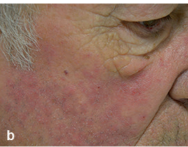
Fig. 1. Clinical examples of nivolumabinduced rosacea. (a) Grade 1 papulopustular rosacea in case 2 and (b) intolerable grade 2 papulopustular rosacea in case 4 induced by nivolumab therapy.

because of unperformed complete skin examination by investigators. Moreover, acneiform rash has been infrequently reported with anti-PD-1 agents, but only by non-dermatologist investigators (5). This so-called "acneiform" rash could potentially correspond, at least in part, to a papulopustular rosacea. The pathophysiology of rosacea remains poorly understood, involving complex dysregulation of the innate immune, vascular and nervous systems (6). However, it has been postulated that the adaptive immune system, involving CD4<sup>+</sup> Th1/ Th17 cell activities, plays a significant role in the development of all subtypes of rosacea (6, 7). In addition, it has been demonstrated that blockade of the PD-1 receptor may promote Th1/Th17 pathways (8). We therefore can speculate that anti-PD-1 monoclonal antibodies may favour the development of either psoriasis (4) or rosacea in predisposed patients. Clinicians should be aware of this new dermatological adverse event, which remains, in our experience, self-limiting, but may lead to temporary