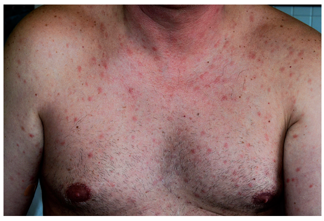
Fig. 1. Erythematous papular eruption on the trunk.

The most common infectious agents associated with cutaneous rashes (secondary syphilis, HSV 1–2, VZV,